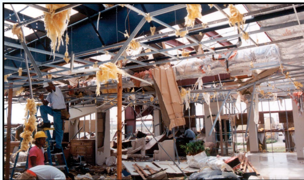
Typhoon damaged furniture showroom, second floor. Heavy damage was sustained to contents.

The model for typhoons in Asia is comprehensive and leverages historical data to create a robust probabilistic event set providing uniform extreme risk metrics for all locations in the basin. The event set includes approximately 150,000 stochastic and approximately 1,800 historical events. The model has been developed using detailed historical data, including storm footprint representations for each storm. The hazard and vulnerability models have been reviewed by the scientific community to ensure the model incorporates the best available science and provides plausible model outputs.